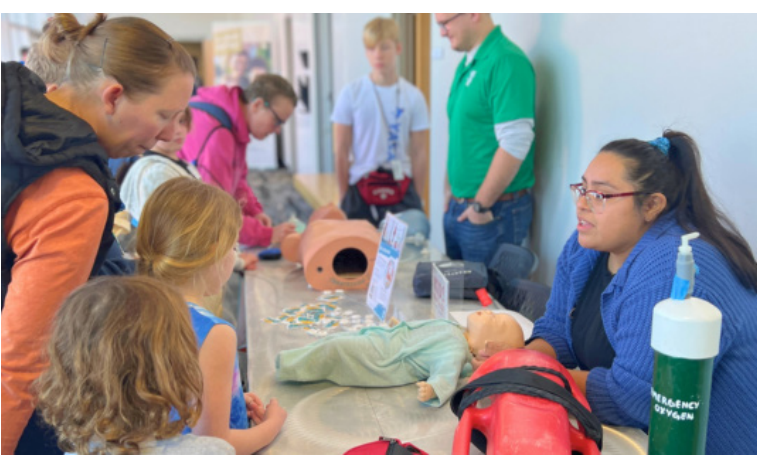
*Special events may be subject to change or cancellation. Visit our website or the front desk for more information about these events.