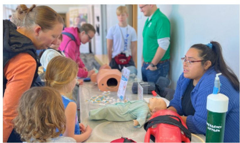
*Special events may be subject to change or cancellation. Visit our website or the front desk for more information about these events.